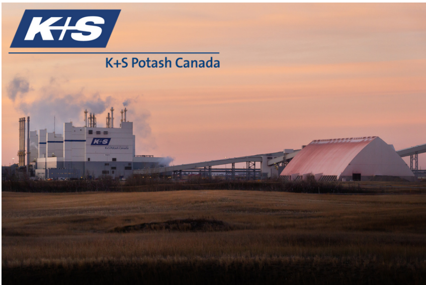
image: Bethune Mine